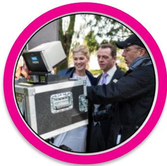
FILM AND TELEVISION