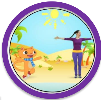
INTERACTIVE AND DIGITAL MEDIA